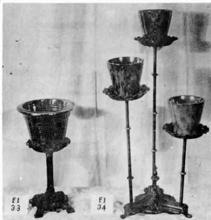
F1 A 6-in. Spanish flower pot with attractive wrought iron 33 fern holder. Mottled or solid colors.