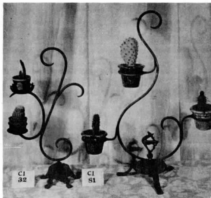
C1 New and different—little wrought iron cactus holders, 32 Spanish in design—for patio or garden. In gay colors. Complete with native Catalina Cactus. In two sizes. C1 81